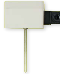
GTMU-MP-AP4 duct probe Standard type: FL = 100 mm, D = 6 mm