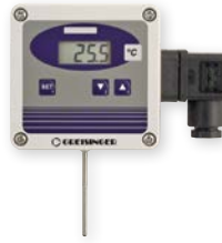
GTMU-MP-AP3 indoor / outdoor probe for direct wall mounting Standard type: FL = 50 mm, D = 3 mm