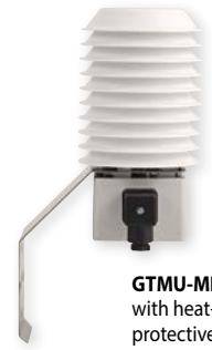
GTMU-MP-SHUT with heat- protective shield