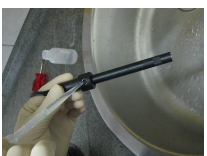
Figure: Filling with pipette

*) suitable gloves: Acc. to DIN EN 420, e.g. natural latex, natural rubber, butyl rubber, nitrile rubber, polychloroprene, fluorinated rubber.