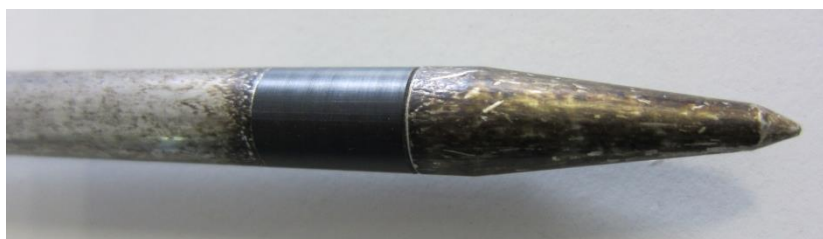
Soiled probe -> wrong measuring!

Especially when measuring in wet hay, the probe may be soiled very strong, this may produce to low measuring displays.